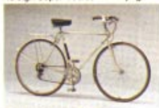
Raleigh Sprite 27 page 14