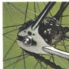
1 - Feature lightened Campagnolo rear fork ends.