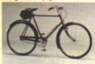
Raleigh Tourist page 15