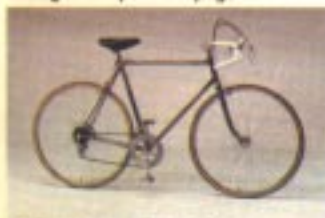
Raleigh Record page 11