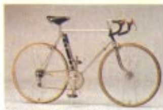
Raleigh Professional Mk. IV page 5