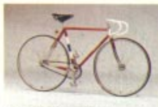
Raleigh Professional Track page 4