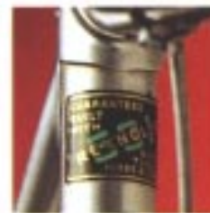
3 - Reynolds 531 butted tubes, stays and forks.