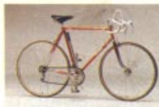
Raleigh International page 6