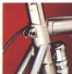
1 - Famous "Victor" direct seat stay cluster.

A custom built bicycle of supreme quality for the racing enthusiast who wants the very best. The frame is of Reynolds 531 double butted tubes throughout, chrome-tipped forks and stays . . . fully equipped with CAMPAGNOLO COMPONENTS including brakes, plus pump and many extras.