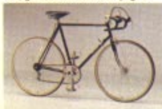
Raleigh Competition page 7