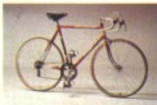
Raleigh Team Professional page 3