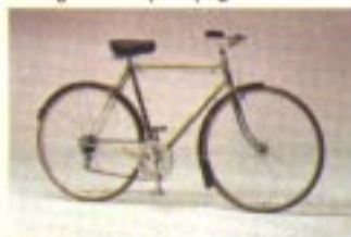
Raleigh Super Tourer page 13