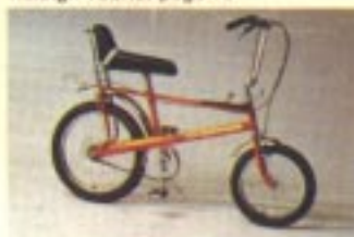
Raleigh Chopper page 19