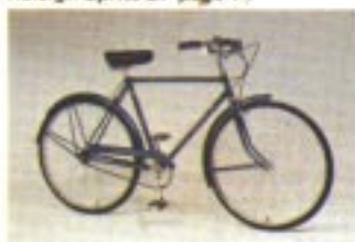
Raleigh Ltd page 17