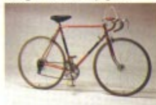
Raleigh Grand Prix page 10