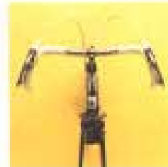
2 - Alloy Randonneur touring handlebar.