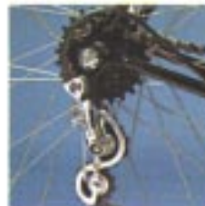
1 - New Huret Jubilee rear Derailleur mechanism.