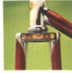
3 - Front fork blade stiffeners.