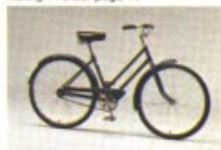
Raleigh Space Rider page 20