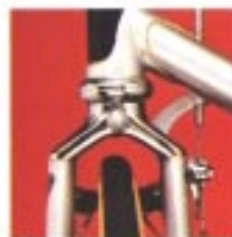
2 - Forged integral sloping fork crown.