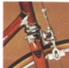
1 - Nervex Professional frame lugs.

Craftsman made, to exacting specifications in Raleighs' Carlton factories . . . the home of the internationally successful Raleigh professional team of riders. The International suits the lightweight tourist and road racer. The frame has Reynolds 531 butted tubes, forks and stays, with chrome front and rear forks is equipped with CAMPAGNOLO COMPONENTS and Weinmann 999 center pull quick release brakes.