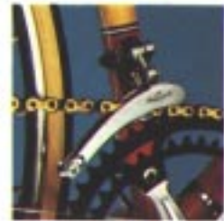
New Campagnolo Super Nuovo Record featuring titanium parts for minimum weight.