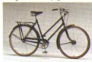
Raleigh Superbe page 15