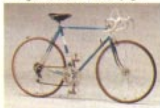
Raleigh Gran Sport page 8