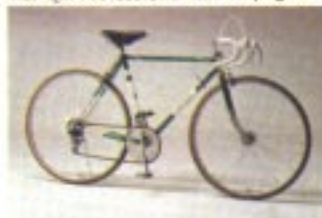
Raleigh Super Course Mk. II page 9