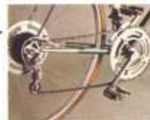
1 - New Huret Challenger 10 speed gear.

Every detail of this super machine is of the highest quality. Specification includes Reynolds 531 tubing, quick release wide-flange alloy hubs, alloy rims, center pull brakes . . . New HURET CHALLENGER 10 speed gear, fitted with cotterless cranks and alloy chainrings and 14/28T cluster for lively style performance. Ladies model features twin lateral stayed MIXTE frame.