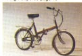
Raleigh Folder page 17