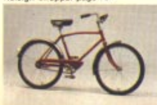
Raleigh Mountie page 20