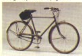
Raleigh Sports page 16