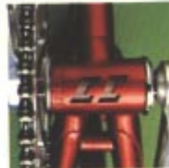
2 - Carlton initial cutout in bottom bracket shell.