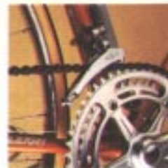
2 - Campagnolo chainwheel set, pedals, hubs and gears.