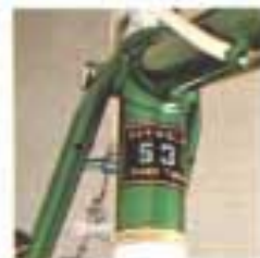
2 - Reynolds 531 main tubes frame.