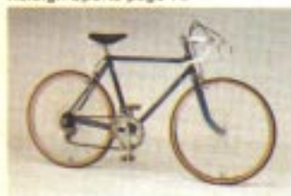
Raleigh Record 24 page 19