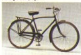
Raleigh Colt page 20