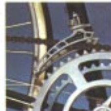
2 - Alloy Cotterless TA double chain-wheel and cranks.