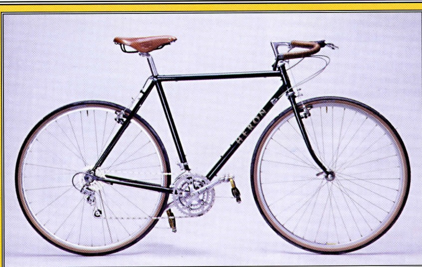
Long, 45.5cm chainstays, clearance for puffy tires and fenders, three bottle braze-ons, custom two-eyelet forged Italian dropouts, custom Reynolds 531 oversized tubing, and a great ride.