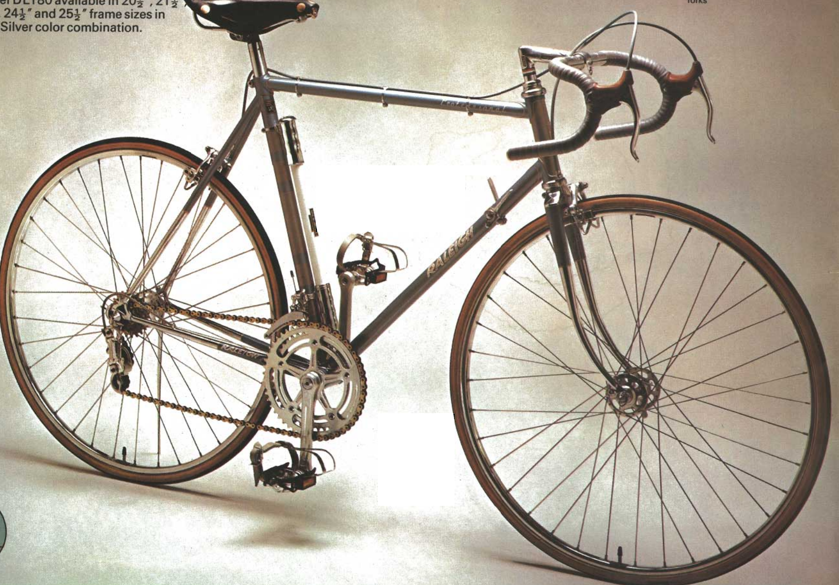
3 - Reynolds 531 Butted tubes, stays & forks