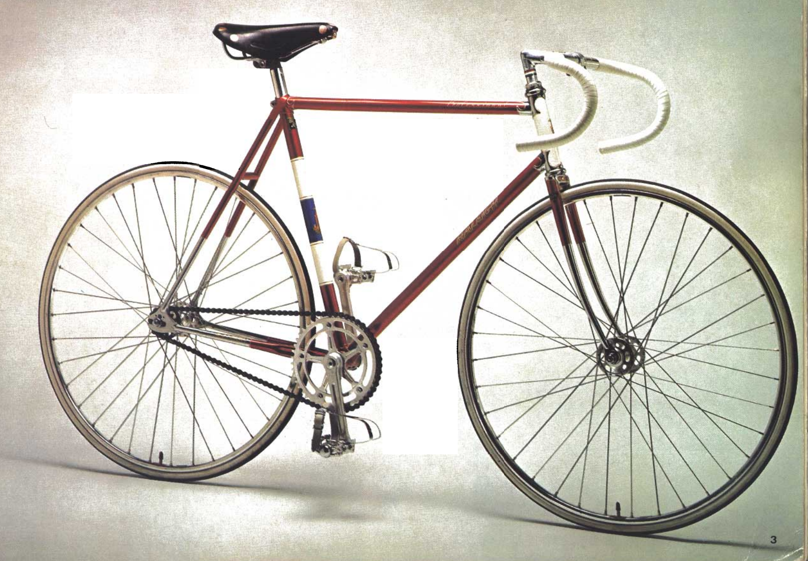
3 – Feature lightened Campagnolo rearfork